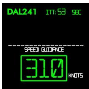
Figure 2. MITRE AGD Interface

3) AGD : An AGD was implemented to allow for the presentation of the parameters believed to be the most pertinent to FIM-S in the pilot's forward field of view. It included three information fields for the user: speed guidance, target aircraft identification, and current spacing interval (i.e., In-Trail Time [ITT]). When a new IM Speed was calculated, a green box illuminated around the speed command for ten seconds, which alerted the crew to the presentation of a new IM Speed. Due to the functionality of the algorithm (described later), the ITT feature of the AGD showed the IM aircraft's current spacing interval with the target aircraft relative to the first point at which the IM and target aircraft routes join past the merge. Participants were instructed that the ITT would not necessarily show them achieving the assigned spacing goal precisely at the achieve-by point, and that they should use ITT only as a general trend indicator. Figure 2 shows the AGD interface used in the study when FIM-S was engaged.