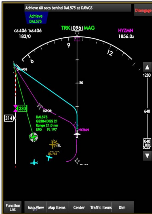
Figure 1. MITRE Multi-Purpose CDTI FIM-S Interface

3) AGD : An AGD was implemented to allow for the presentation of the parameters believed to be the most pertinent to FIM-S in the pilot's forward field of view. It included three information fields for the user: speed guidance, target aircraft identification, and current spacing interval (i.e., In-Trail Time [ITT]). When a new IM Speed was calculated, a green box illuminated around the speed command for ten seconds, which alerted the crew to the presentation of a new IM Speed. Due to the functionality of the algorithm (described later), the ITT feature of the AGD showed the IM aircraft's current spacing interval with the target aircraft relative to the first point at which the IM and target aircraft routes join past the merge. Participants were instructed that the ITT would not necessarily show them achieving the assigned spacing goal precisely at the achieve-by point, and that they should use ITT only as a general trend indicator. Figure 2 shows the AGD interface used in the study when FIM-S was engaged.